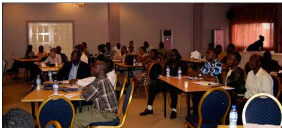
Technical workshop in preparation for LEITI 2nd Report

The Validators found that Liberia complied with basically all validation indicators, but expressed reservation about the (1) publication of LEITI first Reconciliation Report when there were still unresolved discrepancies, and (2) the subsequent decision of the LEITI MSG to undertake an internal exercise to investigate and resolve the discrepancies that were contained in the published report. Subject to the foregoing reservation, “the Validators conclude that Liberia has technically achieved EITI Compliant status.”