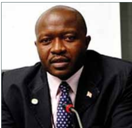
Hon. Augustine K. Ngafuan, Minister of Finance and Chairperson LEITI MSG

E xtensive preparations are underway to ensure that LEITI's 2nd EITI Report of payments and revenues is published in November 2009. The preparations are intended to consider past experiences that led to the publication of unresolved discrepancies in the First Report, and to agree appropriate mechanisms that will not only avoid the repeat of such problems but also enhance the overall credibility and integrity of the forthcoming 2nd LEITI Report.